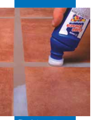
Floor in terracotta treated with Fuga Fresca