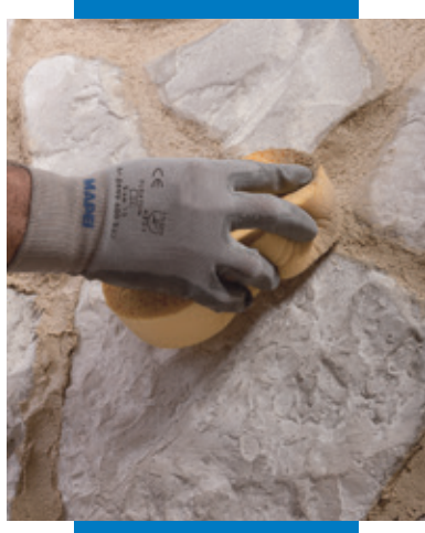
Finishing the surface with a sponge