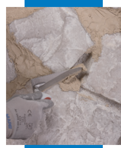
Pointing the joint in a stone wall