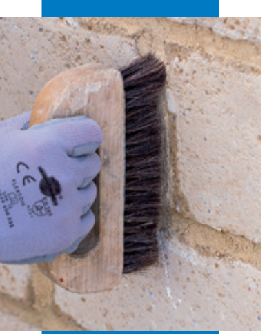
Finishing the mortar ioints