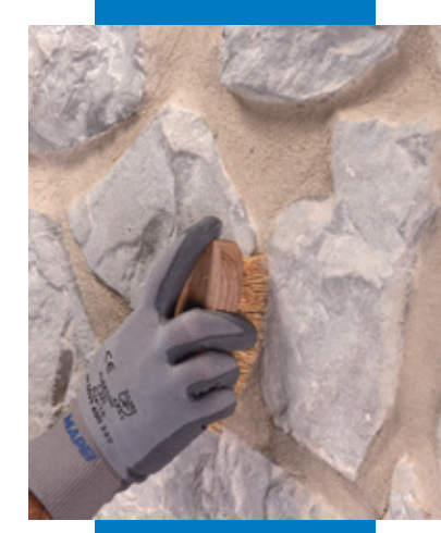
Finishing the surface with a millet brush