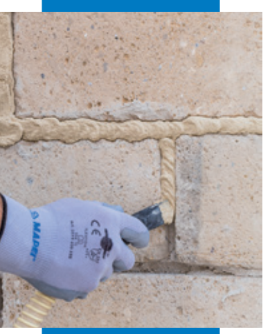
Removing the excess mortar