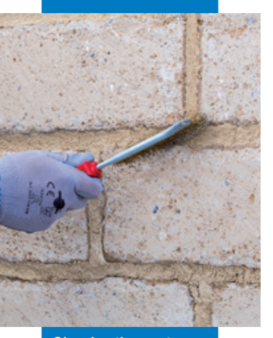
Cleaning the mortar joints with a millet brush